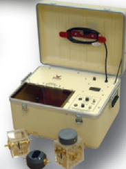
Liquid Dielectric Test Set