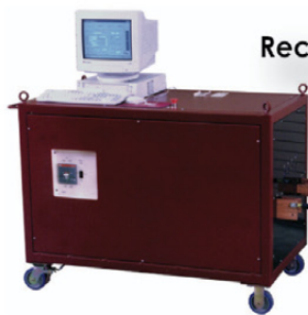
Recloser Test Sets