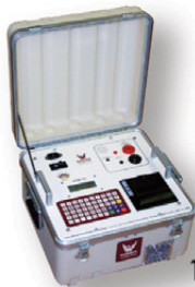
100A Digital Microhmmeter